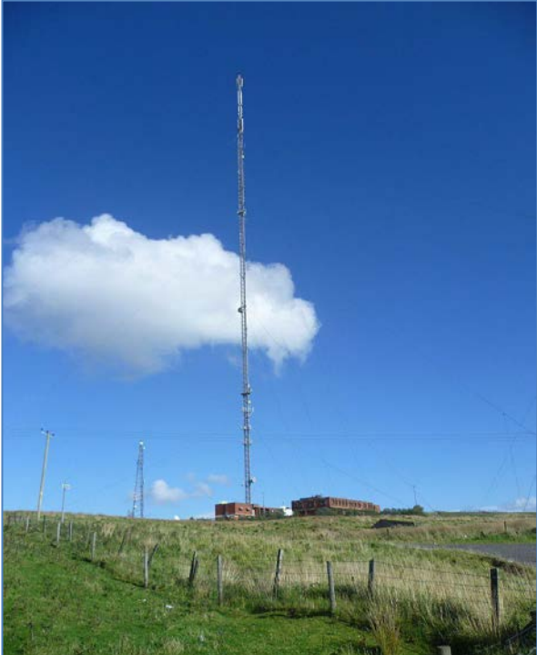
Main TV broadcast Mast (305m)