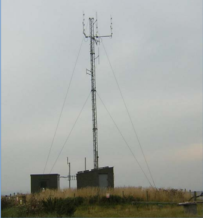
Local Area Broadcast Mast