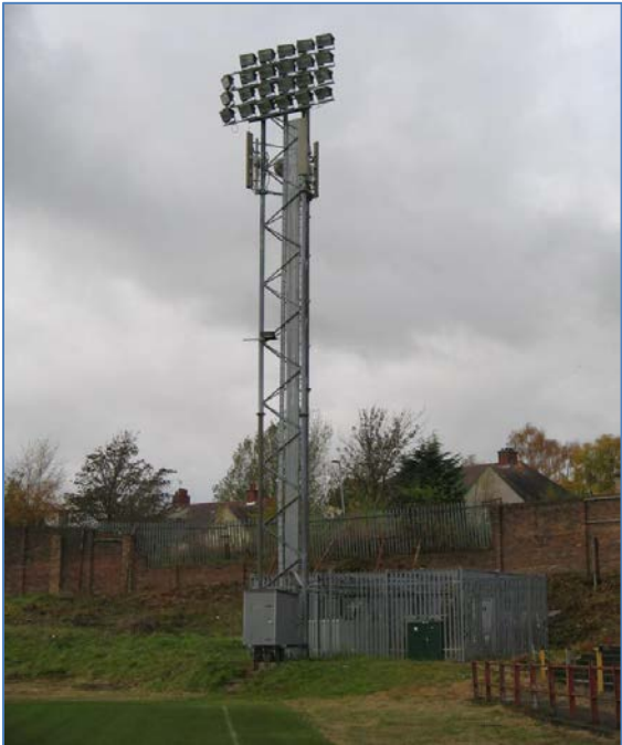
Attached to Floodlight pylon

The following are also to be treated as “Rooftop”