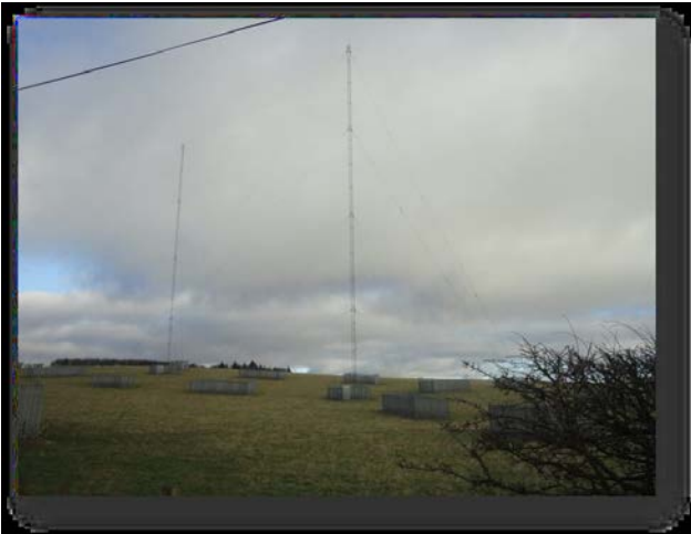
Guyed Radiator Masts