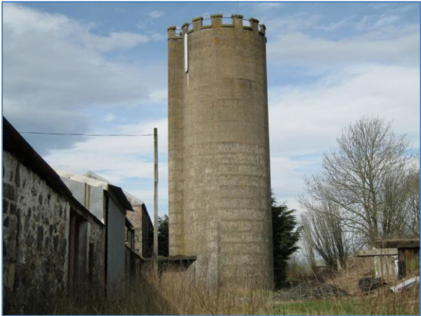
Attached to grain silo