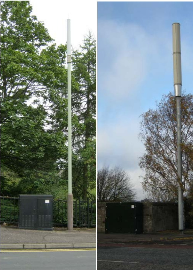
The photograph below shows newly installed streetworks pole with shroud removed. It is clear that there is space for 2 banks of antennae