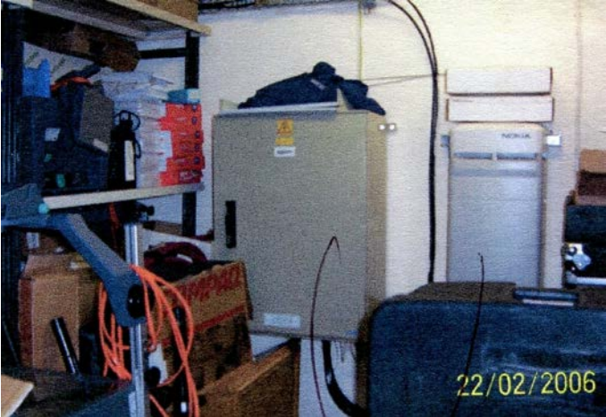
Microcell ancillary equipment within building