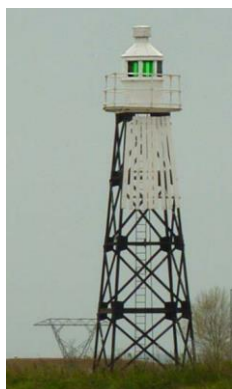
Example of basic lattice structure (approx 15m tall)