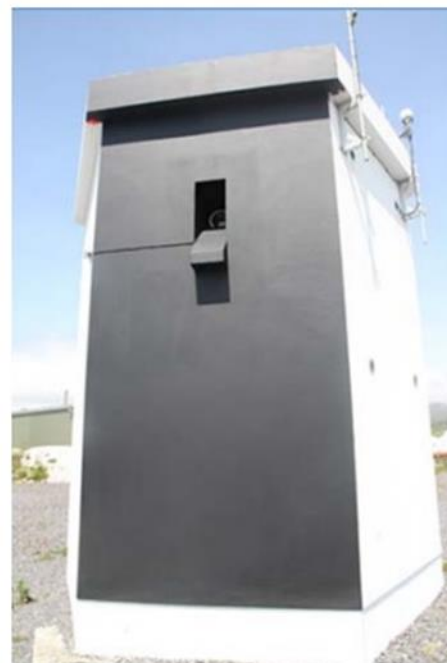
Example of Direction Light & blockhouse with PEL installed internally