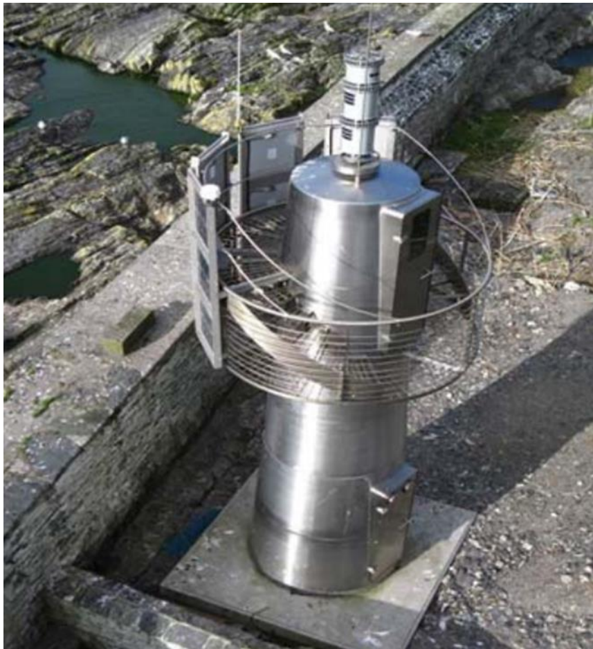
Example of stainless steel tower structure (approx 7m tall)