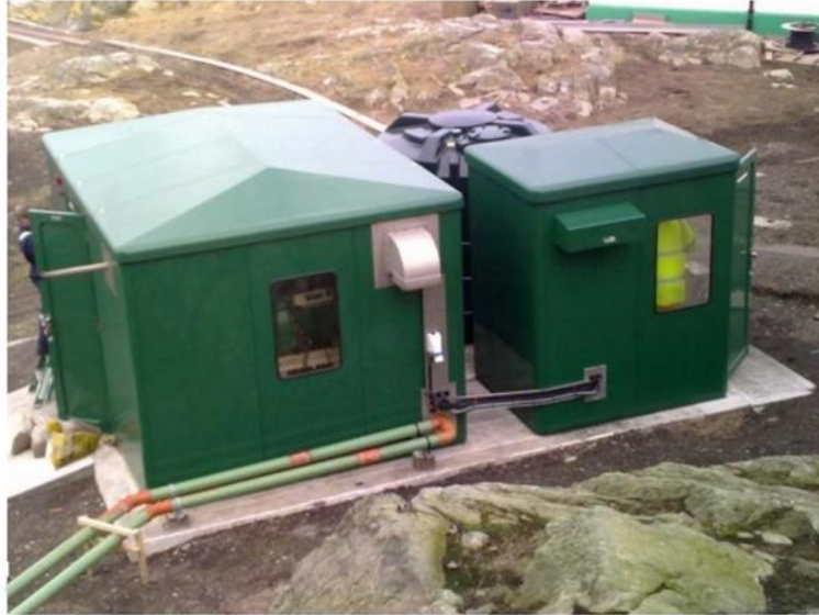
Example of GRP Housing